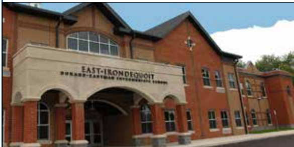
DURAND-EASTMAN INTERMEDIATE SCHOOL GRADES 3-5