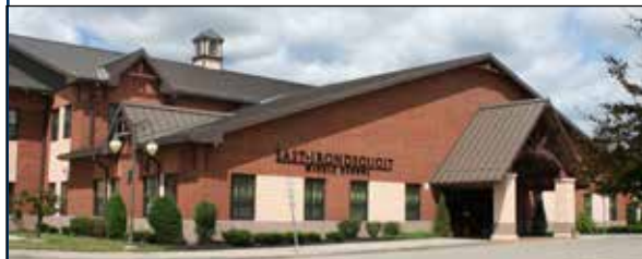
EAST IRONDEQUOIT MIDDLE SCHOOL GRADES 6-8