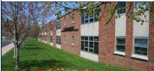
LAURELTON-PARDEE INTERMEDIATE SCHOOL GRADES 3-5