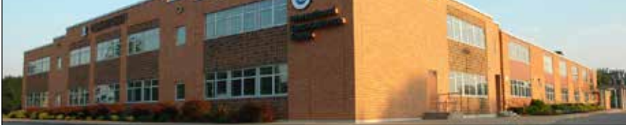
EASTRIDGE HIGH SCHOOL/ NINTH GRADE ACADEMY GRADES 9-12

OUR SCHOOLS – East Irondequoit serves more than 3,000 students in our six schools. Visit our website: www.eastiron.org for more information about our schools.